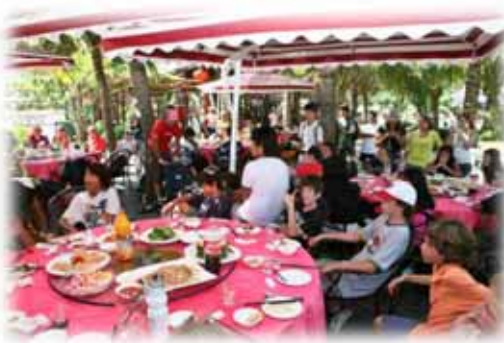
Beach Side Chinese seafood