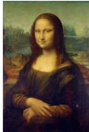
Mona Lisa – Leonardo Da