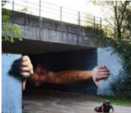
Graffiti artist Cosimo Caiffa street art illusions

In this unit of inquiry we are able to make many cross-curricular connections with Social Studies, English language and Math as students are: reading informational texts to gather information, viewing art and videos about art from around the world, writing about their opinions and about artists, and also using measuring and multiplication skills to design and create art.