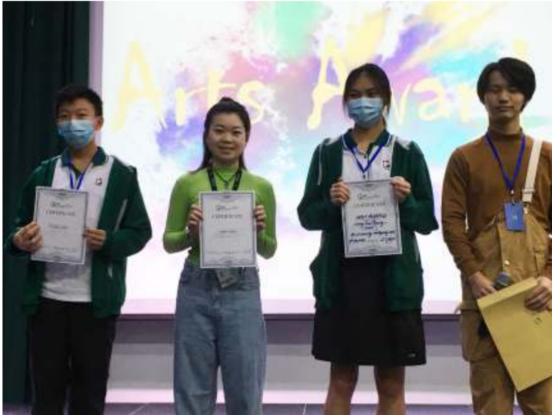
MYP Learner Profile Award