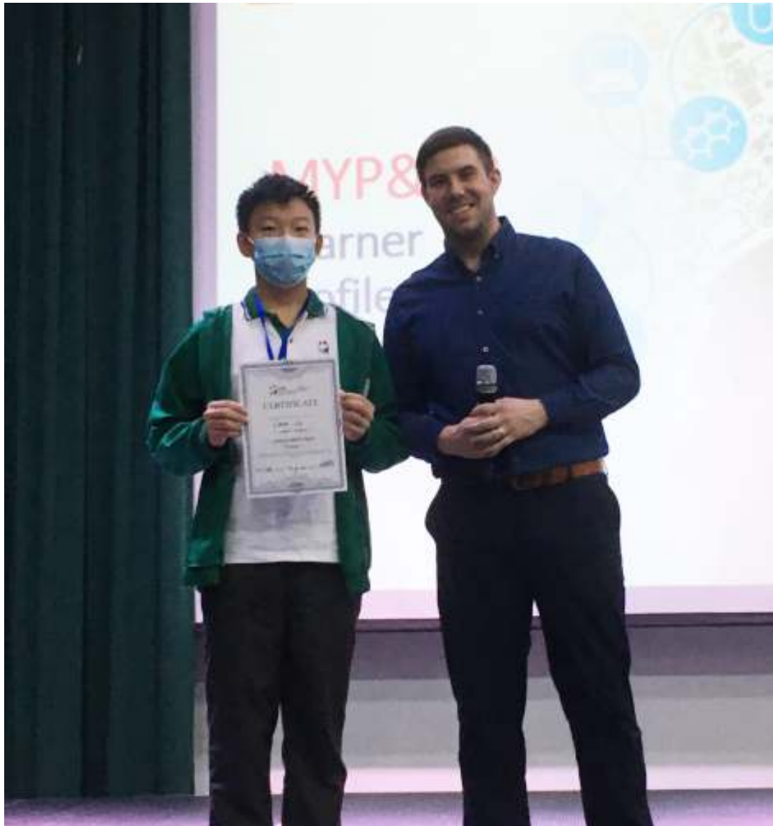
DP Learner Profile Award