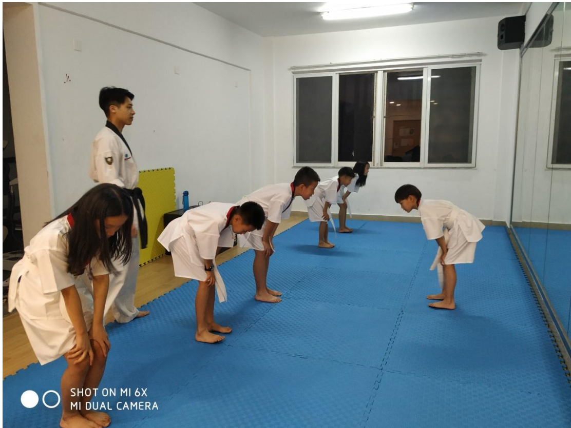
SHOT ON MI 6X MI DUAL CAMERA