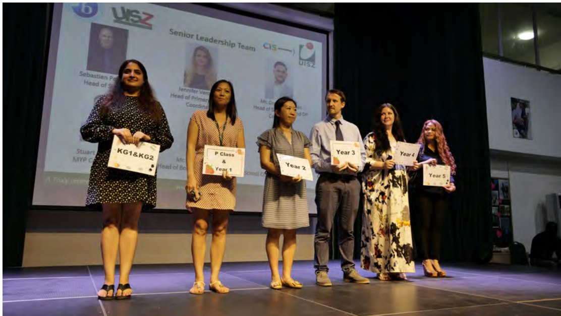
Secondary parent-teacher talk