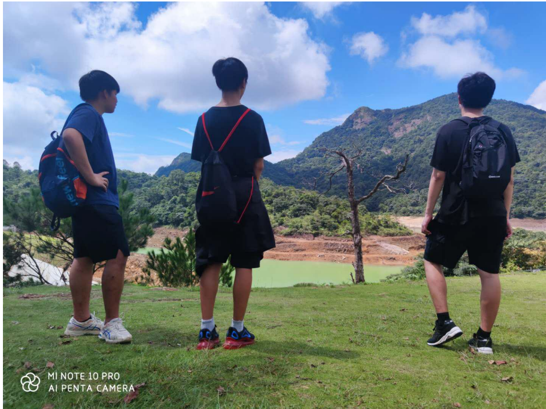
MI NOTE 10 PRO AI PENTA CAMERA

We also managed to escape the downpour that followed. As soon as we stepped out of the exit and boarded the bus, the heavens opened. Looks like it was a great decision at the halfway point to climb descend Baishui Zhai waterfall!