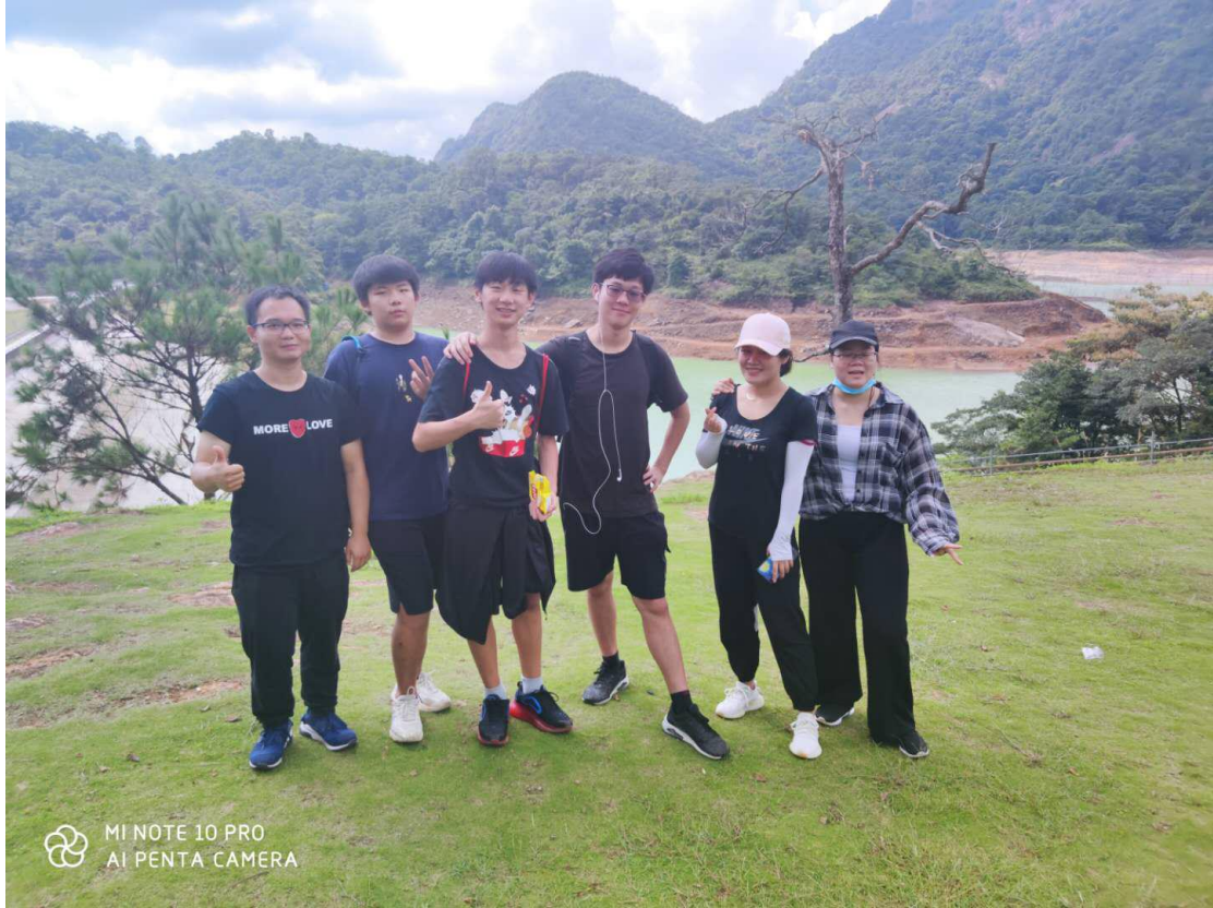
MI NOTE 10 PRO AI PENTA CAMERA