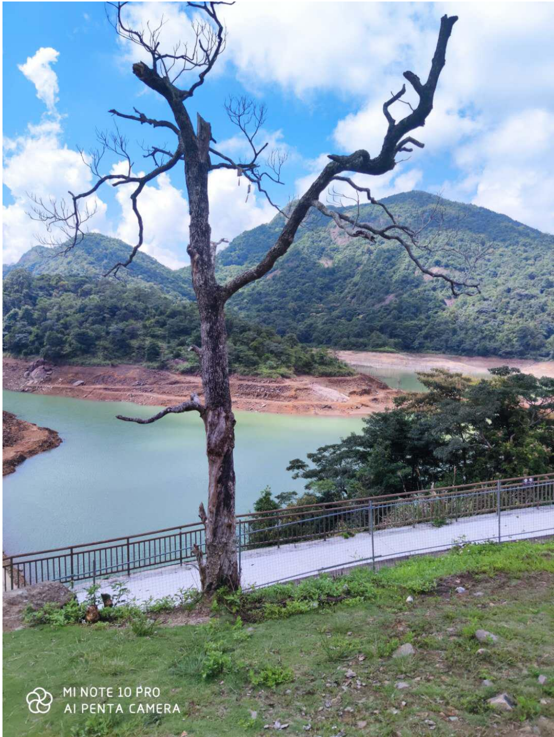
MI NOTE 10 PRO AI PENTA CAMERA