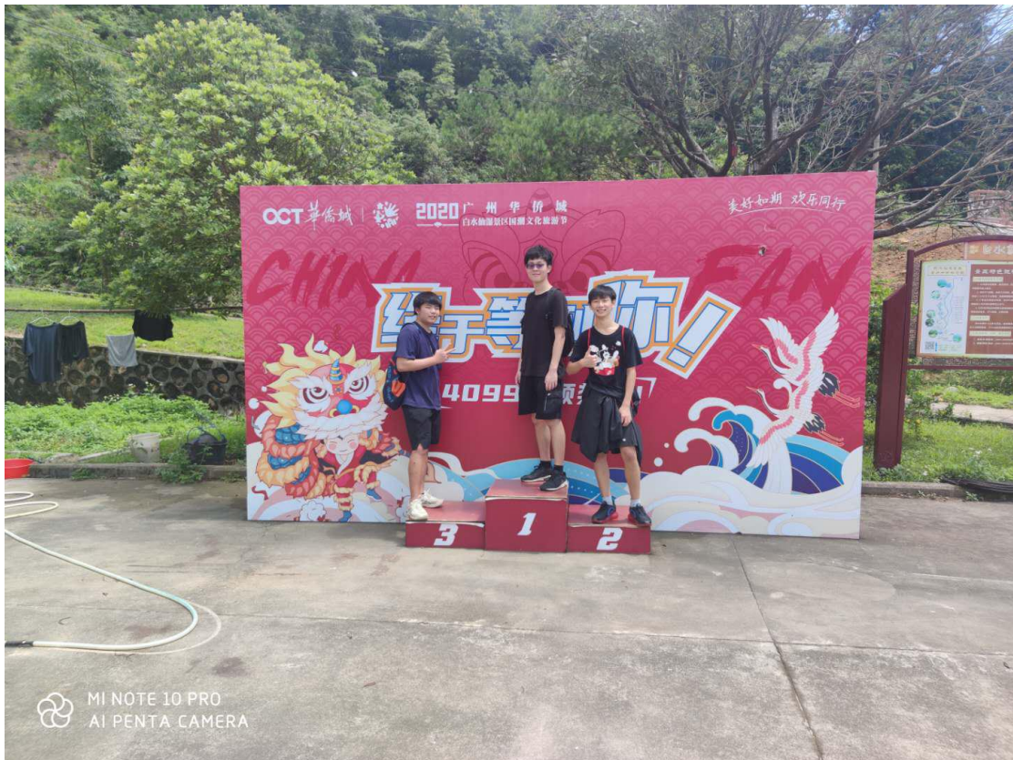
MI NOTE 10 PRO AI PENTA CAMERA