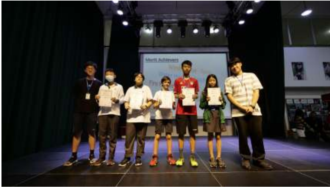
Highest Merit Achiever Award