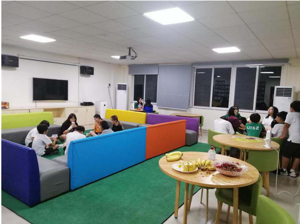
Boarders are enjoying a variety of evening activities in the boarding house.