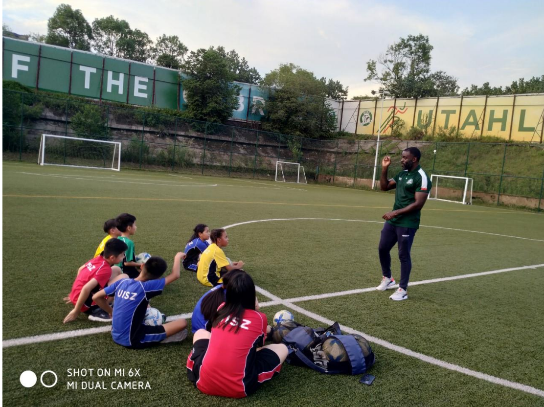
SHOT ON MI 6X MI DUAL CAMERA