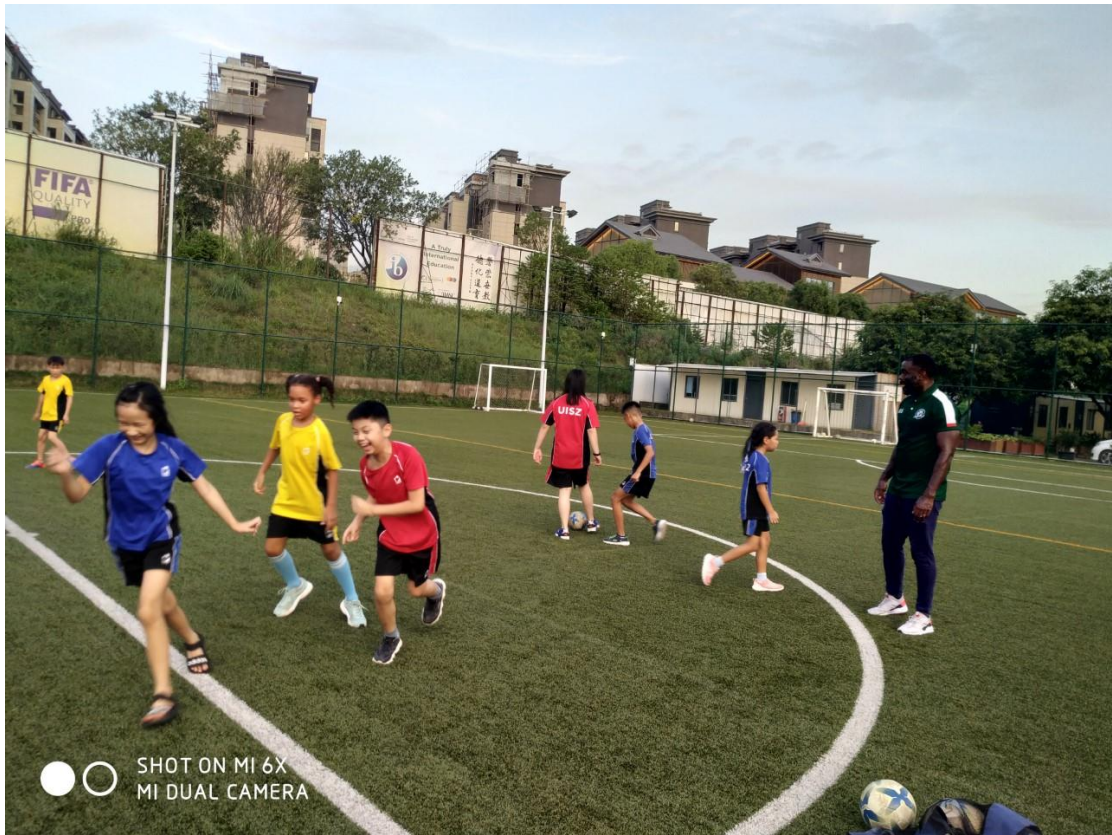
SHOT ON MI 6X MI DUAL CAMERA