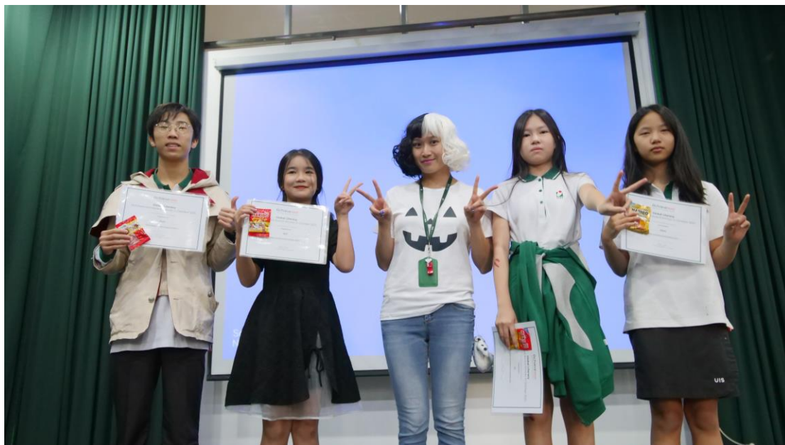
LEARNER PROFILE AWARD 学者成就奖