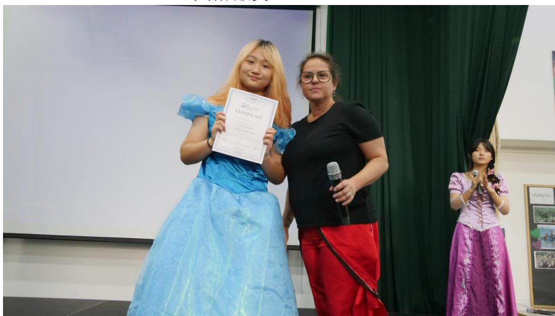
LEARNER PROFILE AWARDS 学者成就奖