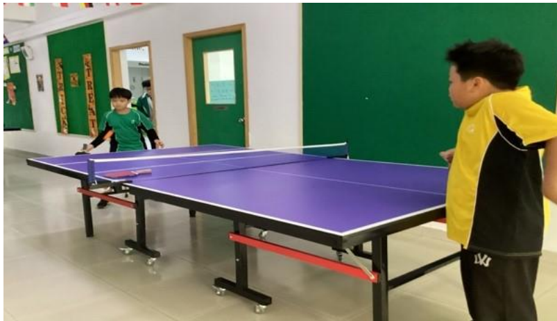
Table tennis CCA students playing the game. 乒乓球 CCA 的学生在打球。

这是一次很好的采访，我们谈及了关于他最喜欢的科目以及乒乓球规则和游戏性。Jaemin 先生是乒乓球国际合作的完美代表。通过打乒乓球，你可以学到的不仅仅是游戏规则，你还可以了解其他文化，结交新朋友。