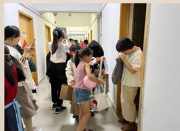
THE STUDENTS VISIT TEACHER'S HOUSE FOR TRICK OR TREATS