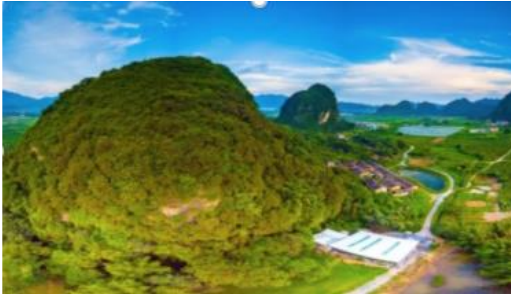
Photo of Yingde karst mountains 英德喀斯特山区的图片