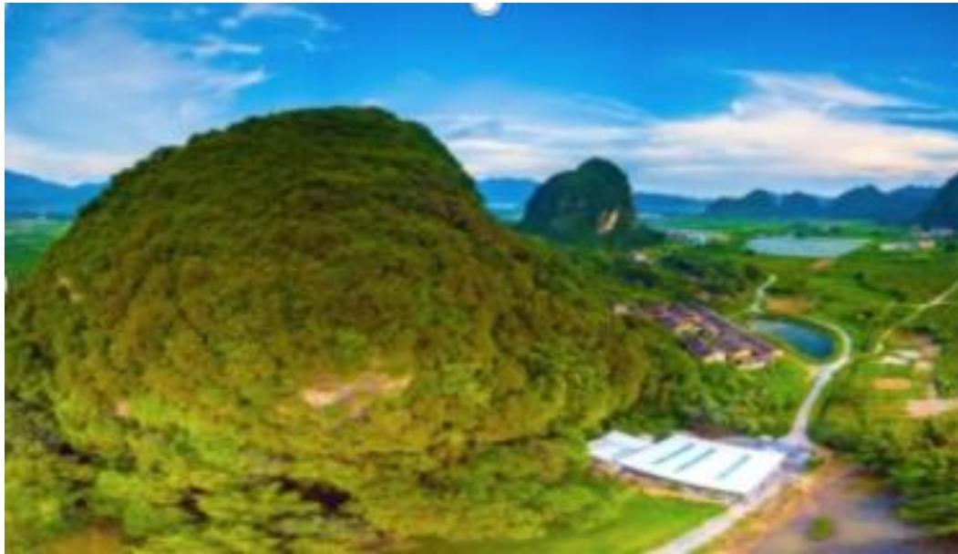
Photo of Yingde karst mountains

Last time, because of COVID 19, the camp that was planned got cancelled. And that's why our school is planning to go on a camp this year. The meaning of 'Week Without Walls' is that if we are inside a classroom there are walls around. But if we explore outside - not at school - there are no walls. And the reason the school is on a camp is because this camping was our school's tradition, and we can have fun and enjoy camping. The activities we are going to do are swimming, climbing walls, trust activities, and other fun activities. The materials we can bring are a phone and camera to take photos about our adventure.