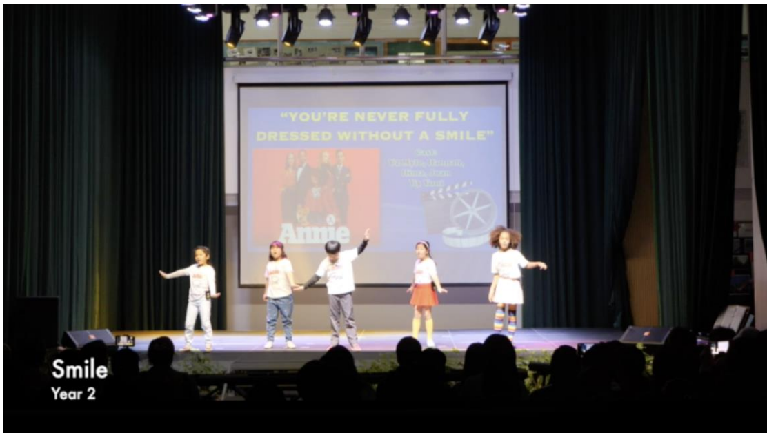
Smile Year 2