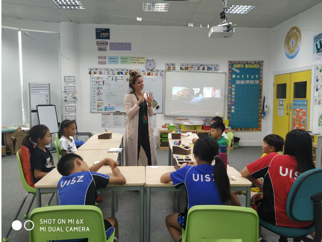
SHOT ON MI 6X MI DUAL CAMERA