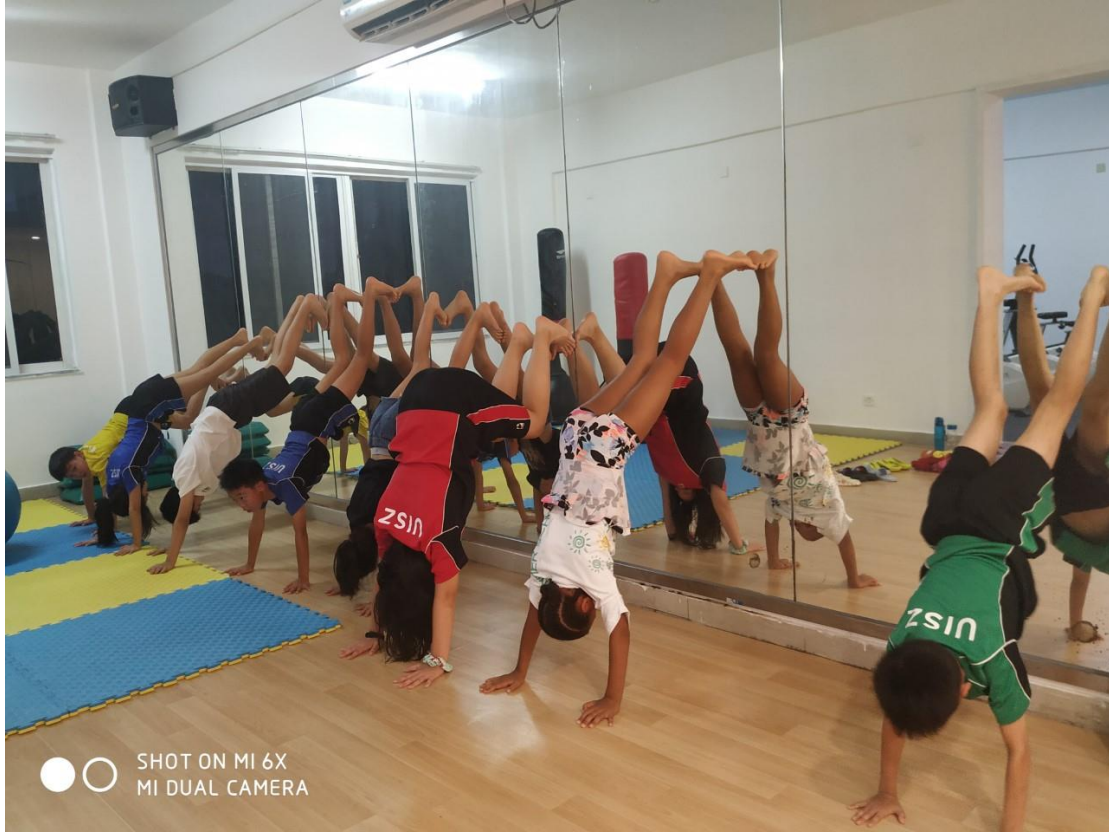
SHOT ON MI 6X MI DUAL CAMERA