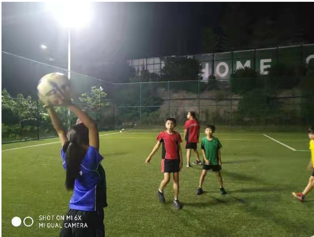
SHOT ON MI 6X MI DUAL CAMERA