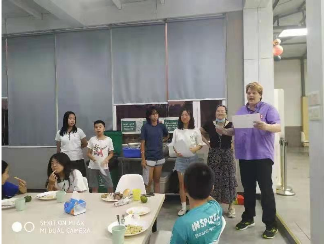
SHOT ON MI 6X MI DUAL CAMERA