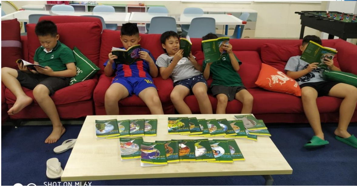
SHOT ON MI 6X