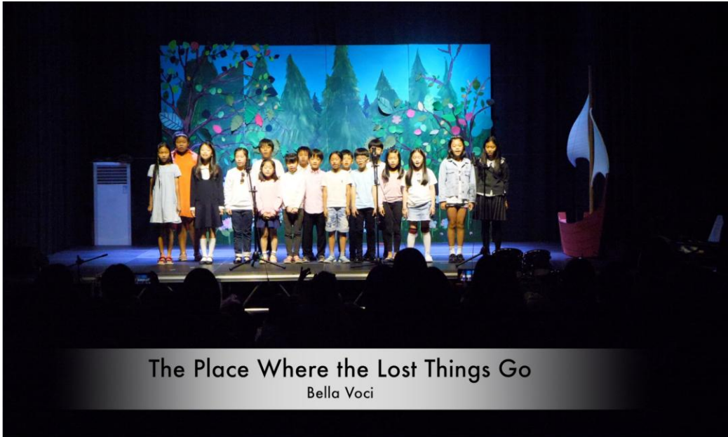
The Place Where the Lost Things Go Bella Voci