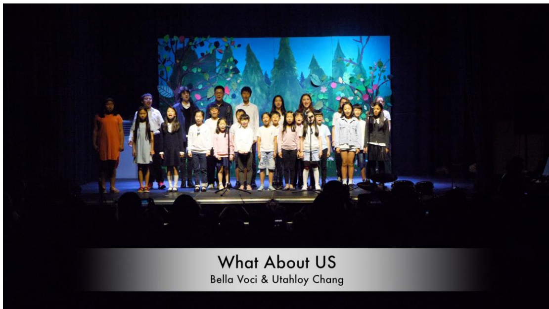
What About US Bella Voci & Utahloy Chang