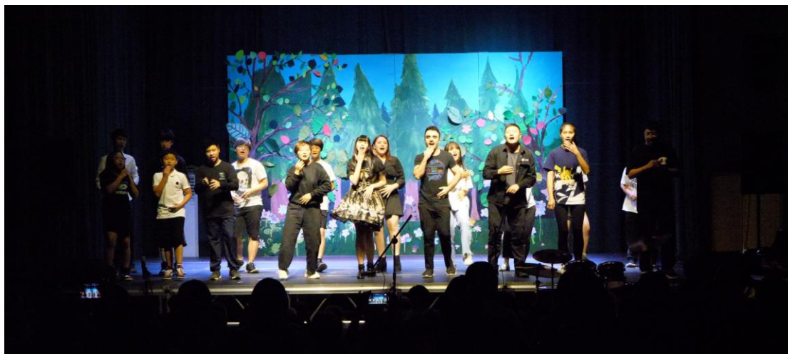
Bills Wind House