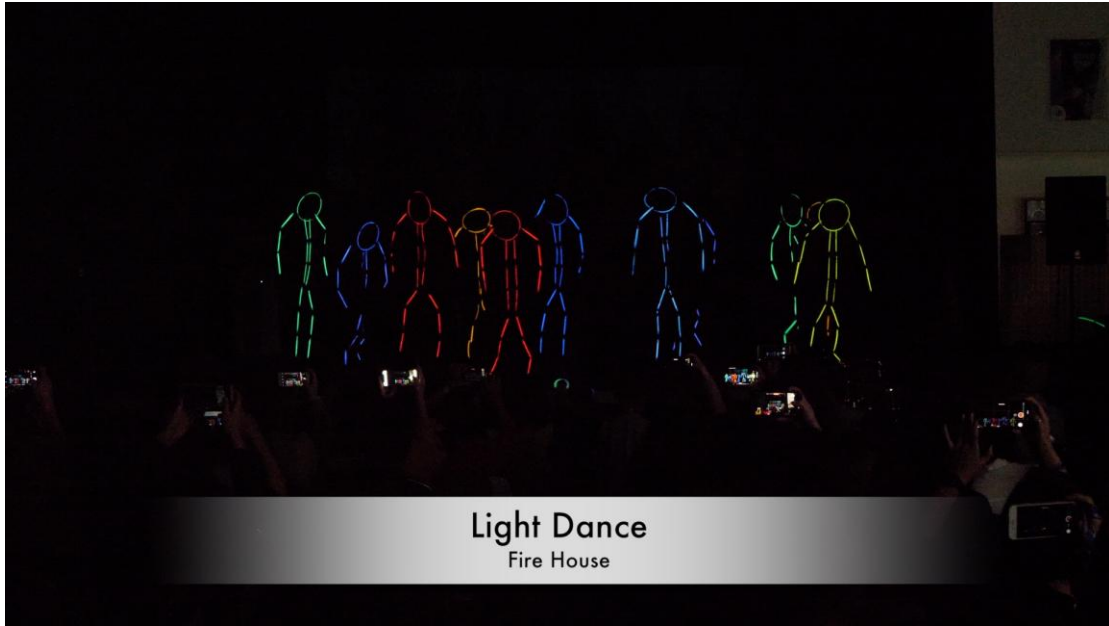
Light Dance Fire House