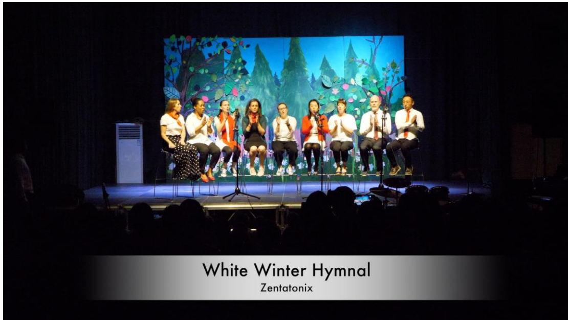
White Winter Hymnal Zentatonix