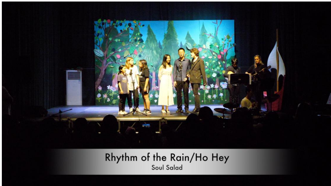
Rhythm of the Rain/Ho Hey Soul Salad