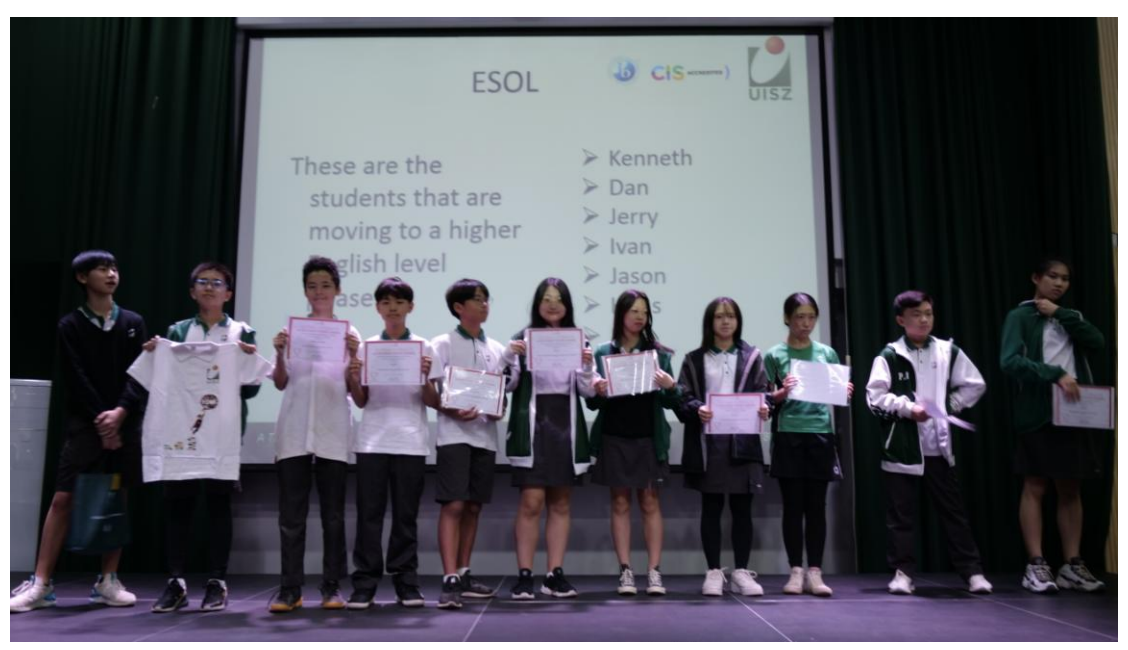
Let's take a look now at what's been happening on campus during this first week back: